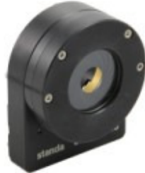
Ø5..27 mm motorized irises